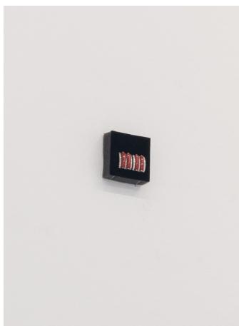
Céline Mathieu Teeth, 2023 - Earrings: 1,2 x 1,4 x 0,8 cm - Pictures: 10,2 x 16,4 cm Second hand earrings, images for online sale Two photos (included)