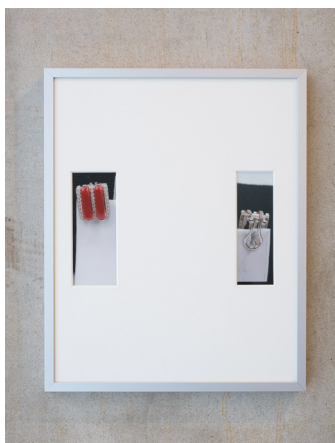
Céline Mathieu Framed Teeth II, 2023 Online sale images of secondhand earrings - First photograph: 4,4 x 11 cm - Second photograph: 3,6 x 11 cm - Frame: 25,5 x 31,3 cm Edition of 3 plus 1 AP & 1 EC