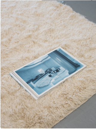
Céline Mathieu Rare Air, 2023 190 x 220 cm Borrowed carpet, open book Sound work, Shoes