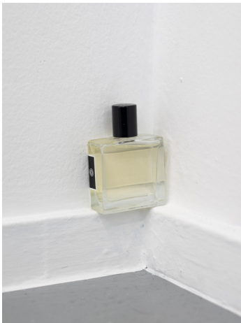
Céline Mathieu Pepper, 2023 5,6 x 2,4 x 8,4 cm Perfume