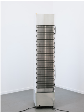
Céline Mathieu Sugar, 2023 39 x 45 x 188 cm Fridge, gallery worker's lunch, handwritten note