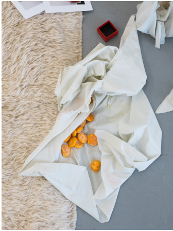
Céline Mathieu Eggs, 2023 ~ 34 x 66 x 6 cm Eggs, salt, T.B. 's help, cloth