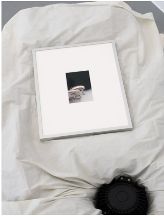
Céline Mathieu Framed Teeth I, 2023 Online sale image of secondhand earrings Picture: 7 x 11 cm Frame: 25,5 x 31,3 cm Edition of 3 plus 1 AP & 1 EC