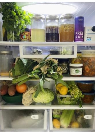
Céline Mathieu Rachelle Robinett, 2023 14 x 11 cm Printed photograph (not framed) Edition of 3 plus 1 AP & 1 EC