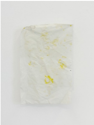
Céline Mathieu Apricots, 2023 17 x 27 cm fabric, egg yolk, salt, lamp