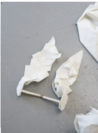
Céline Mathieu Express Thanks First, 2023 ~ 18 x 27 x 4 cm Fabric, foil