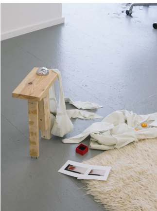
Céline Mathieu Stool, 2023 ~ 14 x 28 x 42 cm Stool, fabric, horsehair, chocotoff