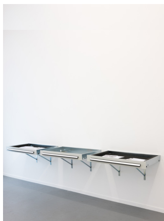
Céline Mathieu Practical Self Reliance, 2023 324 x 60 x 10 cm Three META drawers, sound absorbing material, salt cured egg yolks, photograph of Rachel Robinett's fridge Sotheby's Screenshots (included) Audio (included)