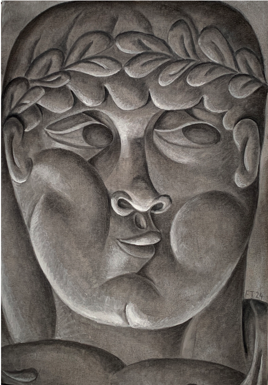
Florian Tomballe Champion, 2024 Charcoal on canvas 170 x 120 cm