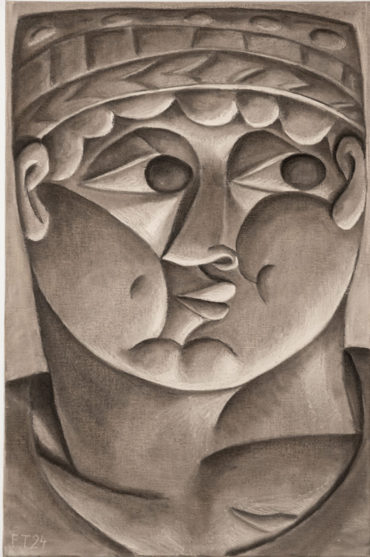
Florian Tomballe Young man with hat, 2024 Charcoal on canvas 90 x 60 cm