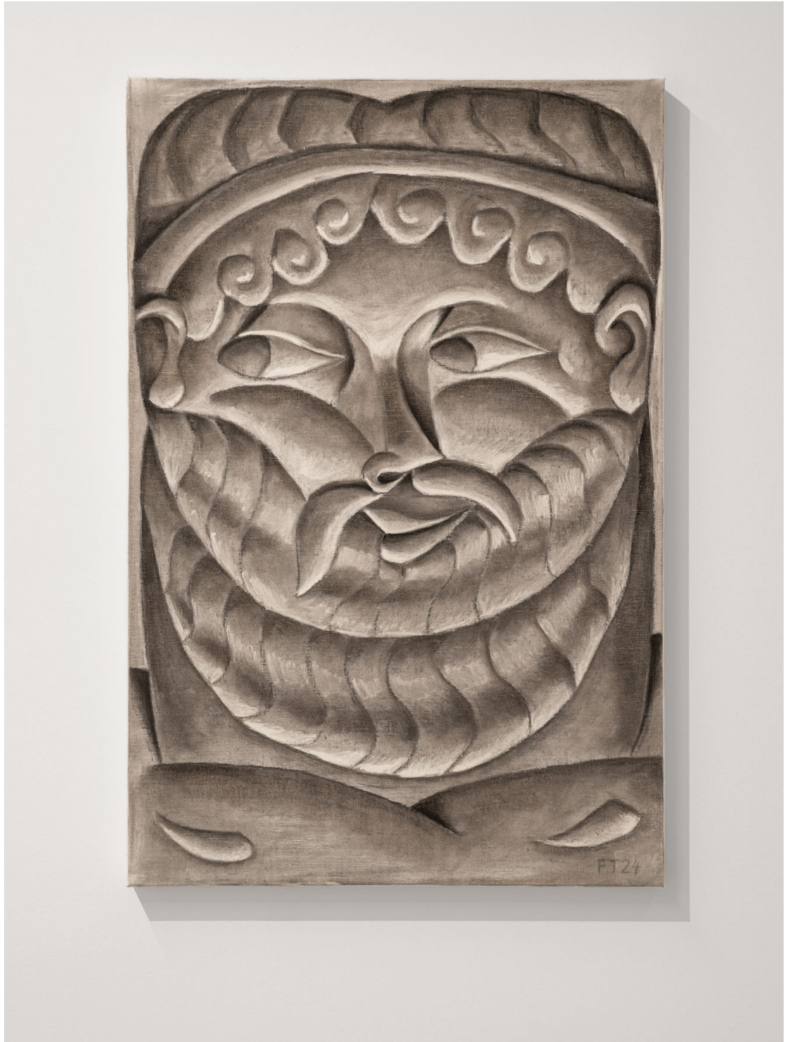
Florian Tomballe Spartan man, 2024 Charcoal on canvas 90 x 60 cm