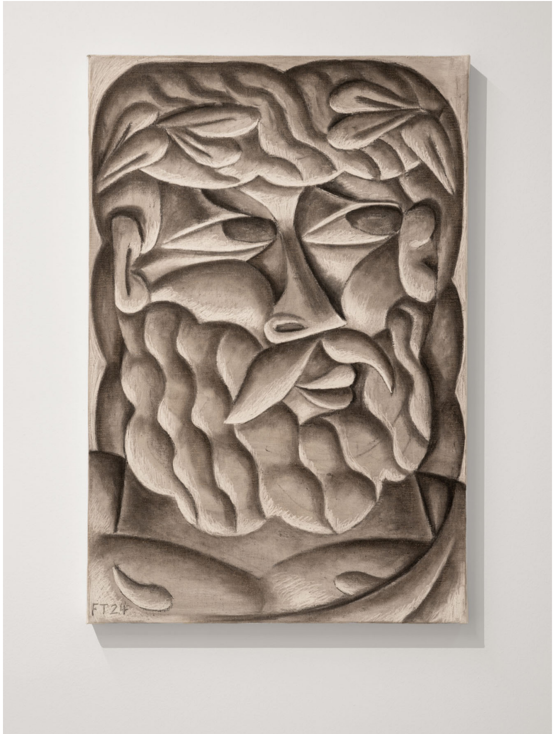
Florian Tomballe Bearded man with laurel wreath, 2024 Charcoal on canvas 90 x 60 cm