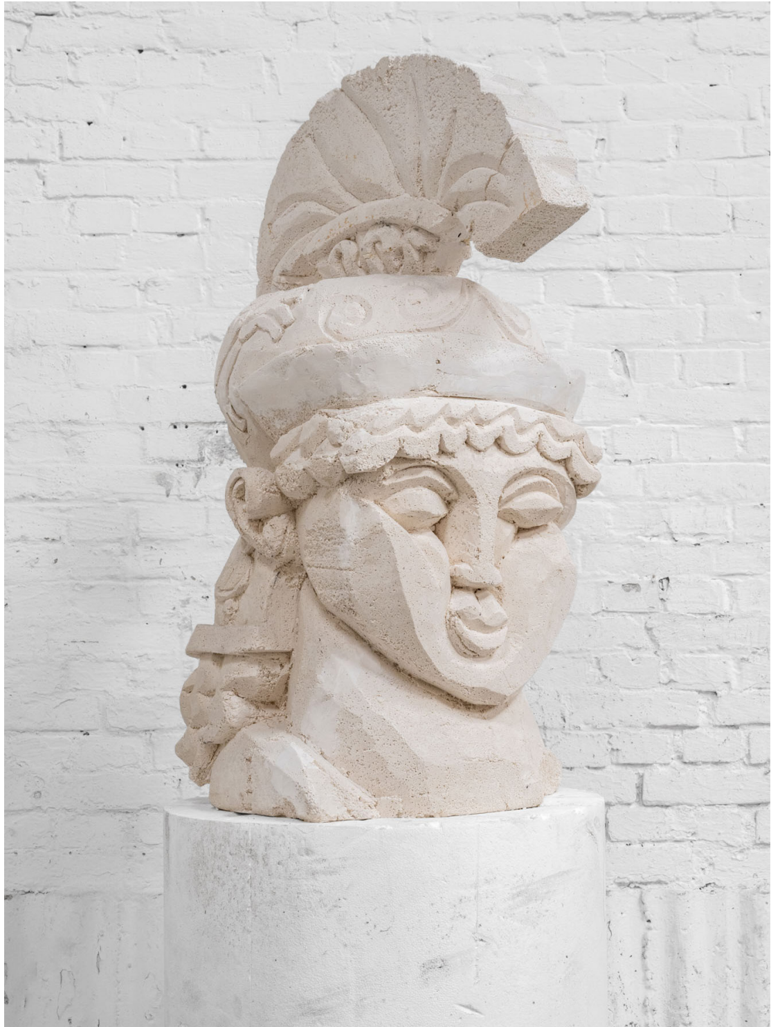
Florian Tomballe Athena, 2024 Acrylic resin 100 x 48 x 40 cm Edition of 3 plus 1 artist's proof