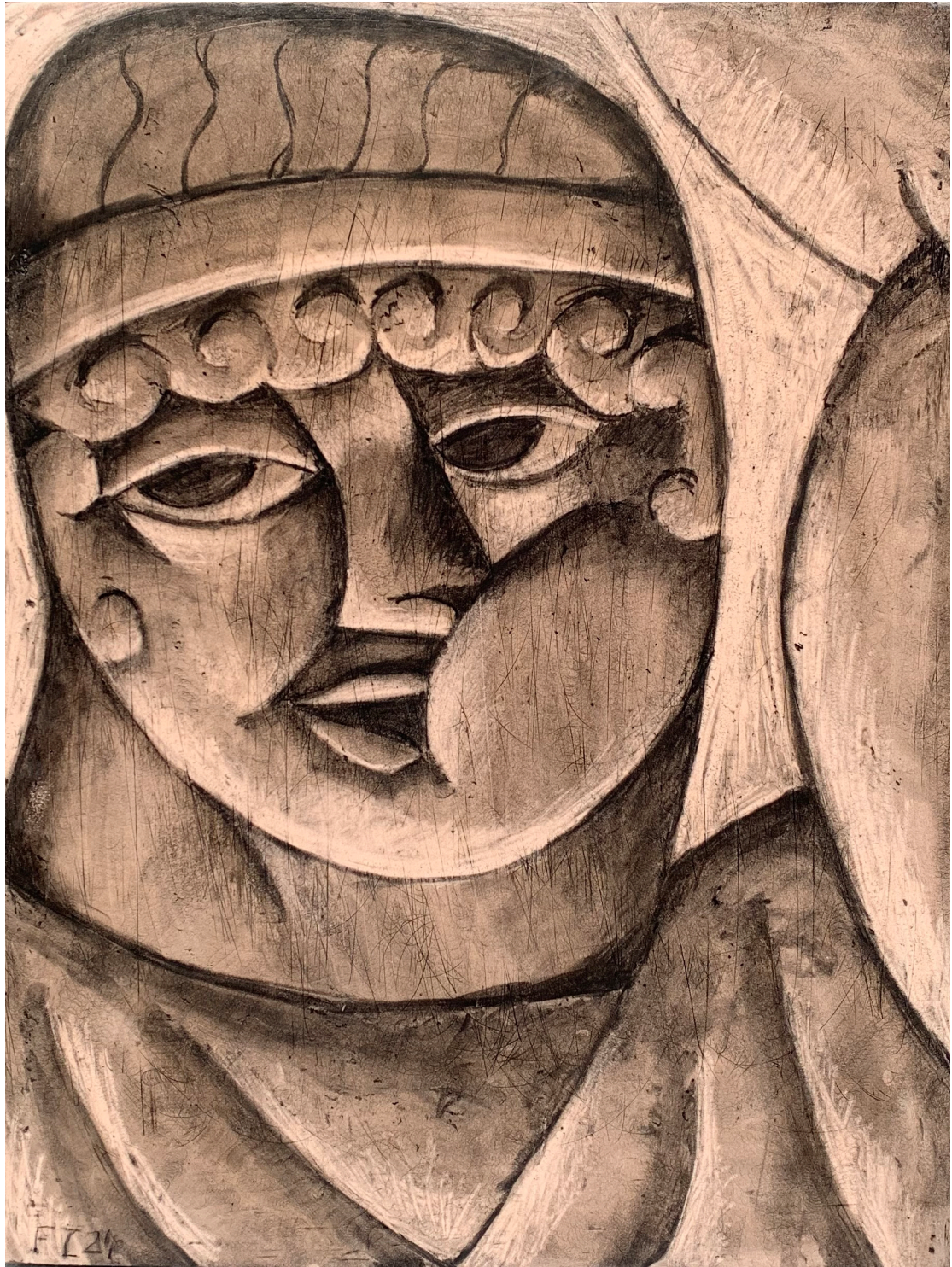
Florian Tomballe Youth with raised arm, 2024 Acrylic resin (pigmented) 50,5 x 64,5 x 7 cm