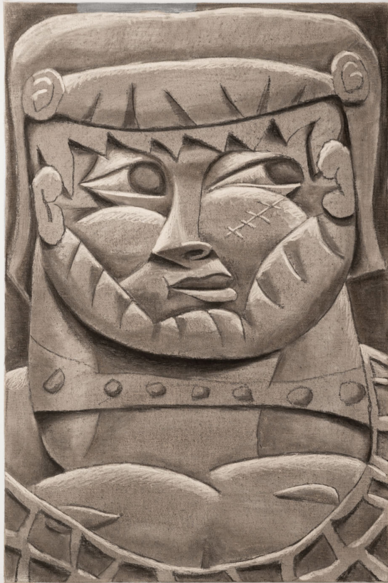
Florian Tomballe Spartan battler, 2024 Charcoal on canvas 90 x 60 cm