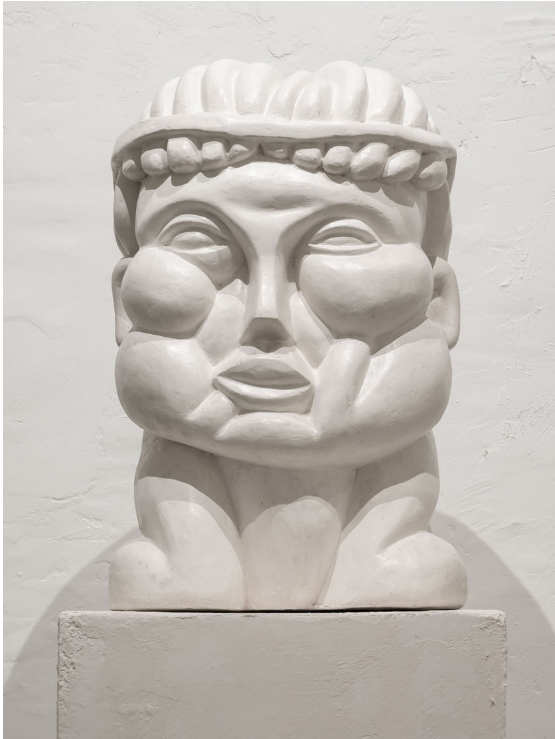
Florian Tomballe Youngling with headband, 2024 Acrylic resin 64 x 42 x 35 cm Edition of 3 plus 1 artist's proof