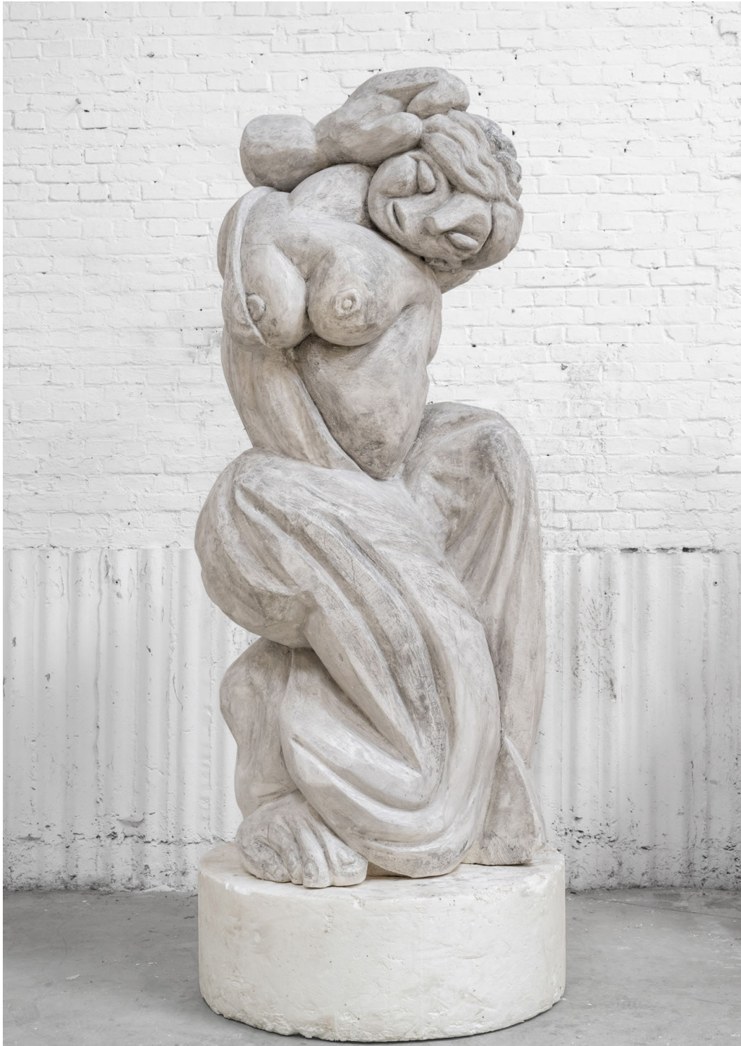
Florian Tomballe Abduction of a lapith girl, 2024 Acrylic Resin 215 x 95 x 85 cm Edition of 2 plus 1 artist's proof