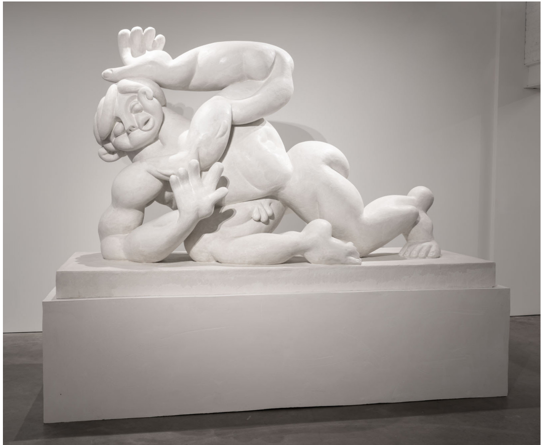
Florian Tomballe Fallen Pompeian, 2024 Acrylic resin 275 x 170 x 100 cm Edition of 2 plus 1 artist's proof