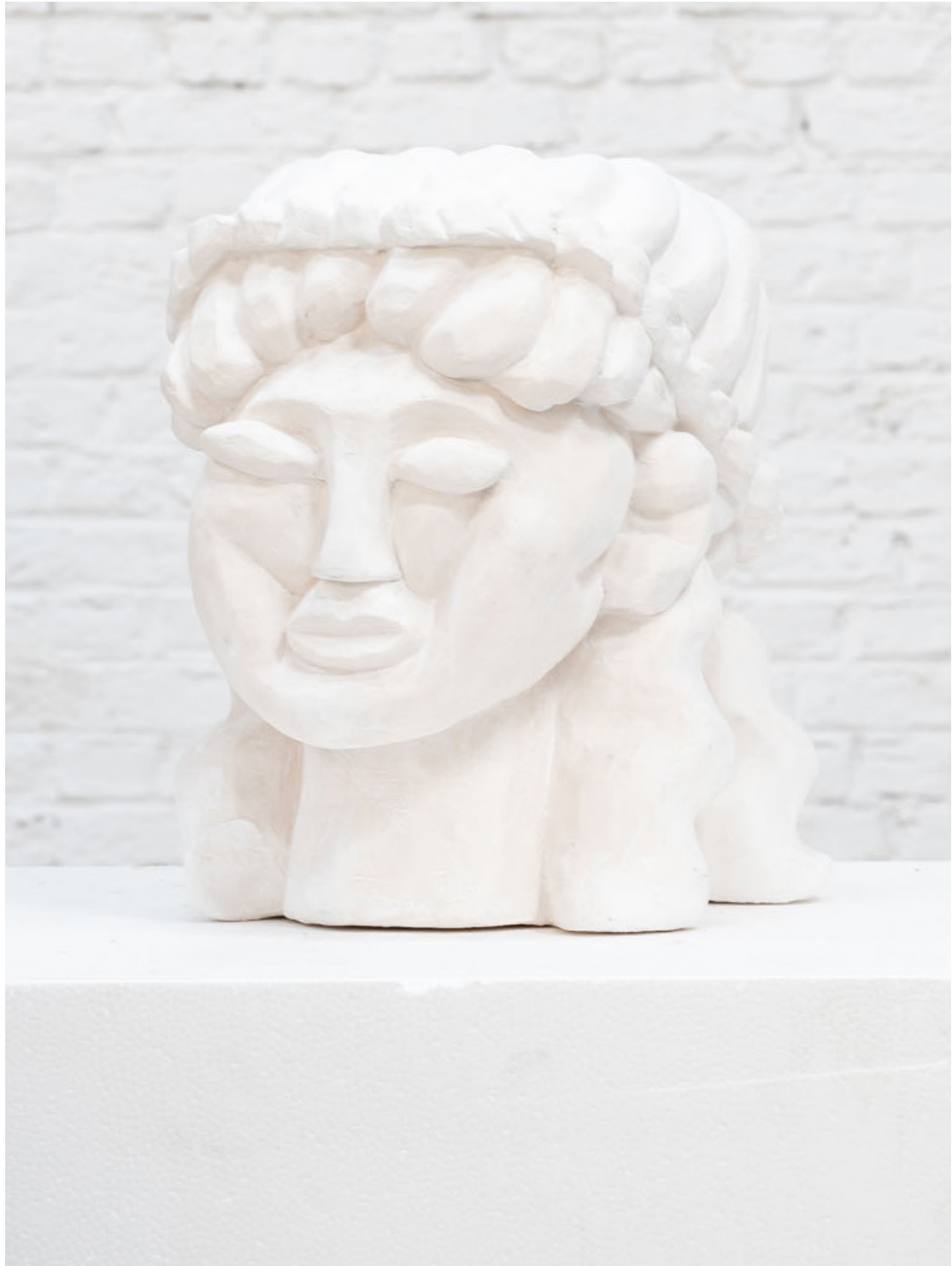
Florian Tomballe Head of a Caryatid, 2021 Acrylic Resin 41 x 28 x 35 cm Edition of 3 plus 1 artist's proof