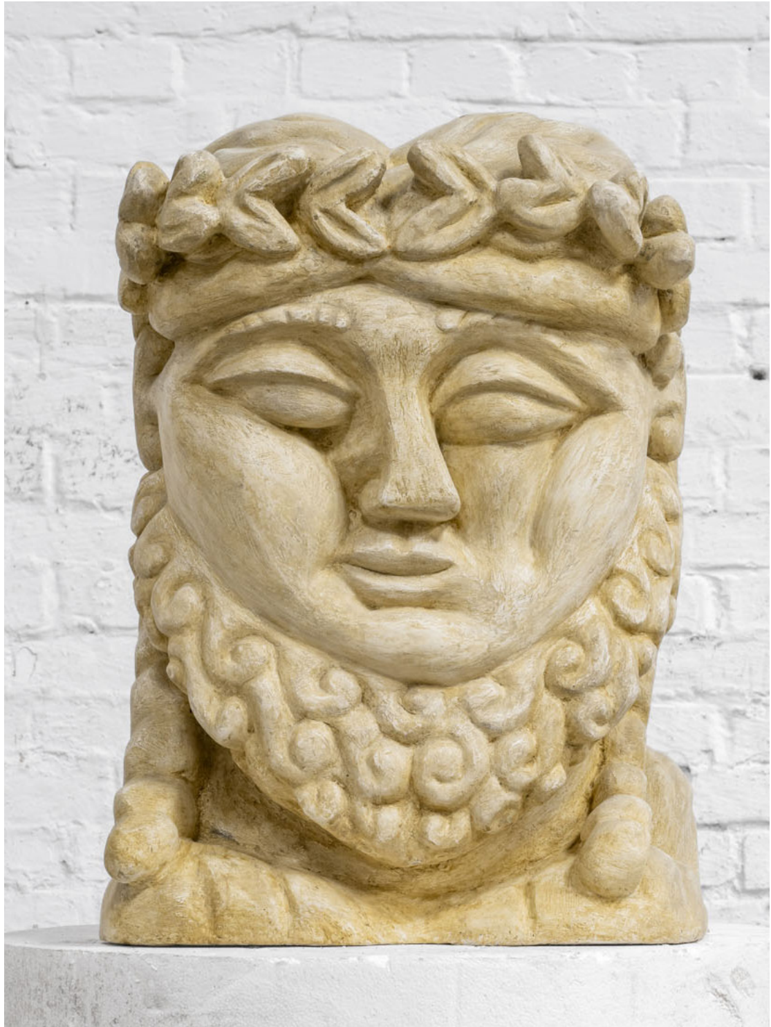
Florian Tomballe Cypriot, 2024 Acrylic Resin 60 x 42 x 44 cml Edition of 3 plus 1 artist's proof