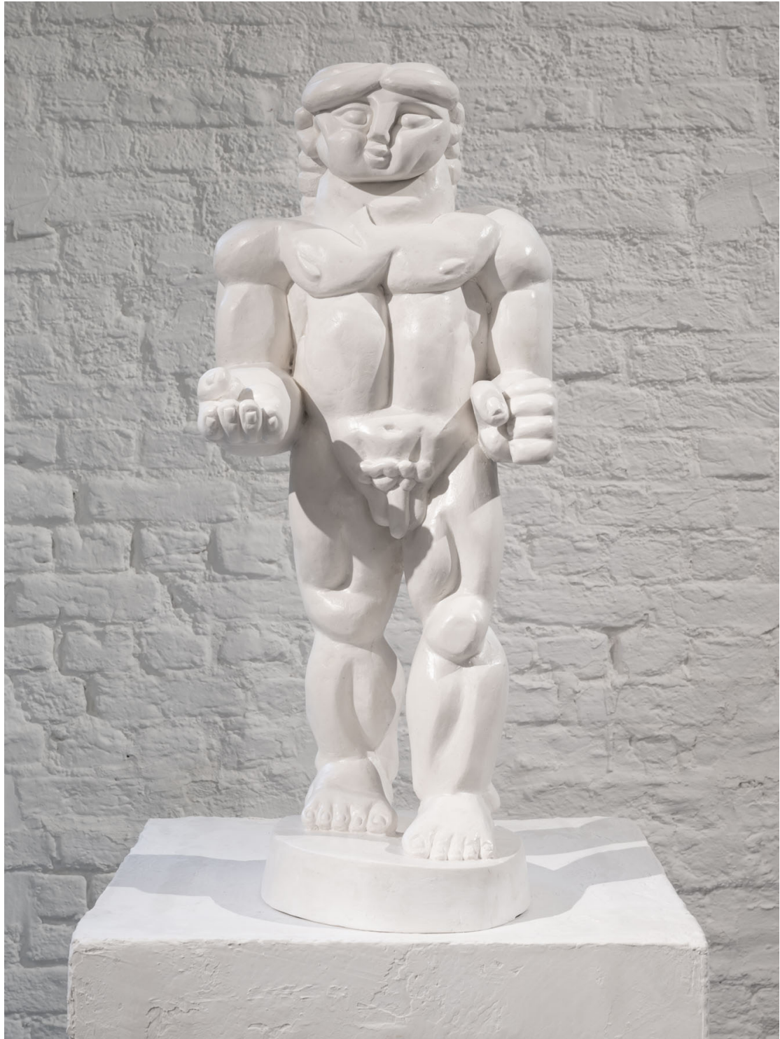
Florian Tomballe Kouros with braided hair , 2024 Acrylic resin 69 x 28 x 30 cm Edition of 3 plus 1 artist's proof