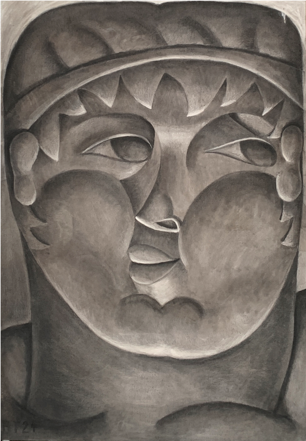
Florian Tomballe Young man staring, 2024 Charcoal on canvas 170 x 120 cm