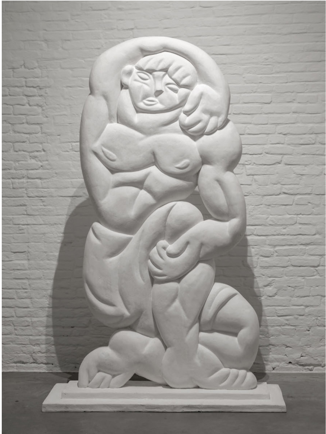
Florian Tomballe Stretching athlete, 2024 Acrylic resin 200 x 100 x 10 cm Edition of 2 plus 1 artist's proof