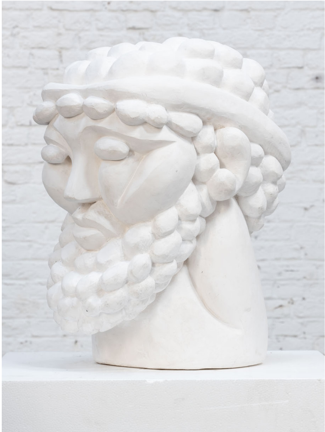
Florian Tomballe Bearded man, 2022 Acrylic Resin 64 x 44 x 51 cm Edition of 3 plus 1 artist's proof