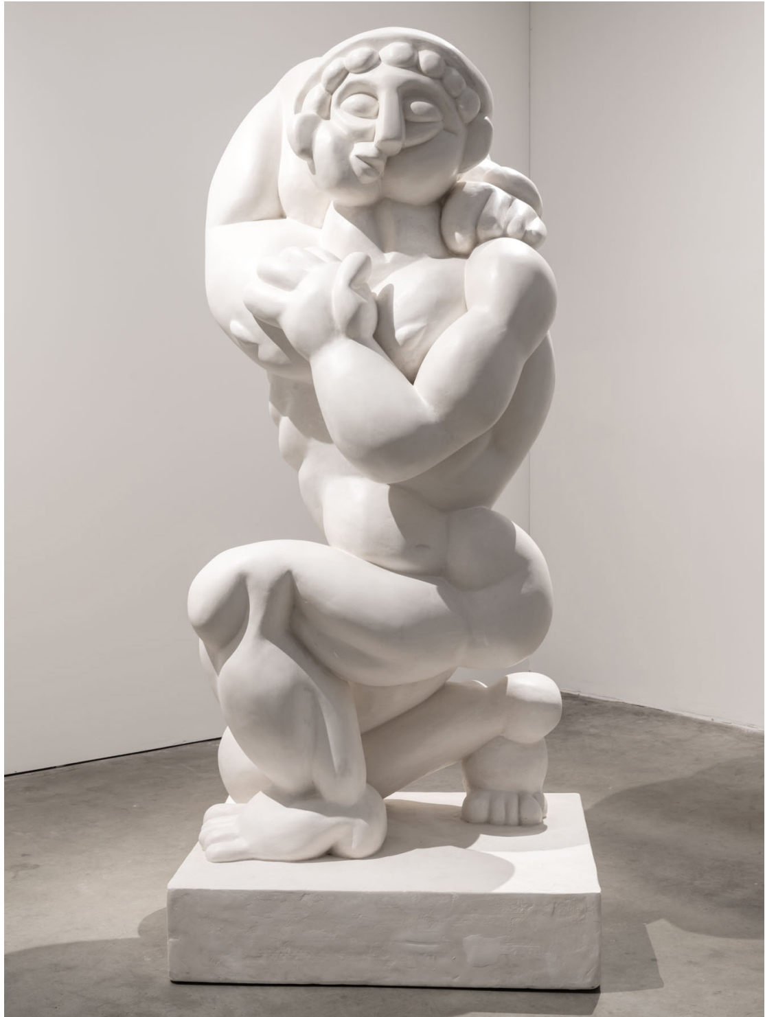
Florian Tomballe Stretching Athlete, 2022 Acrylic Resin 200 x 80 x 90 cm Edition of 2 plus 1 artist's proof