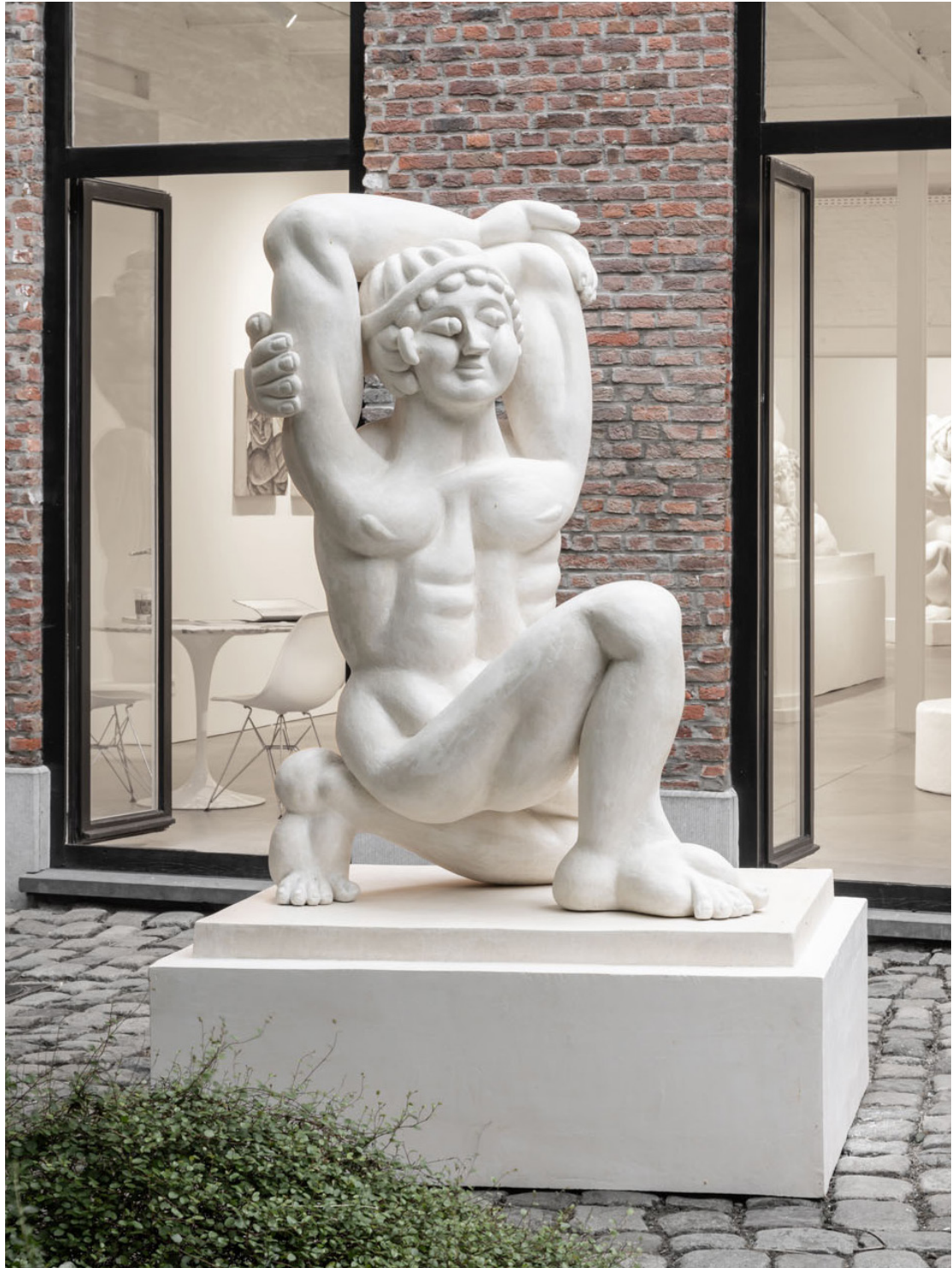
Florian Tomballe Kneeling bather, 2024 Acrylic resin 150 x 104 x 75 cm Edition of 2 plus 1 artist's proof