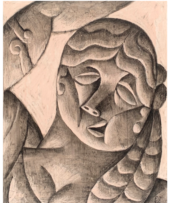
Florian Tomballe Abducted Lapith, Young Lapith, Fighting Centaur, Lapith Girl, 2024 Acrylic resin (pigmented) 50,5 x 64,5 x 7 cm